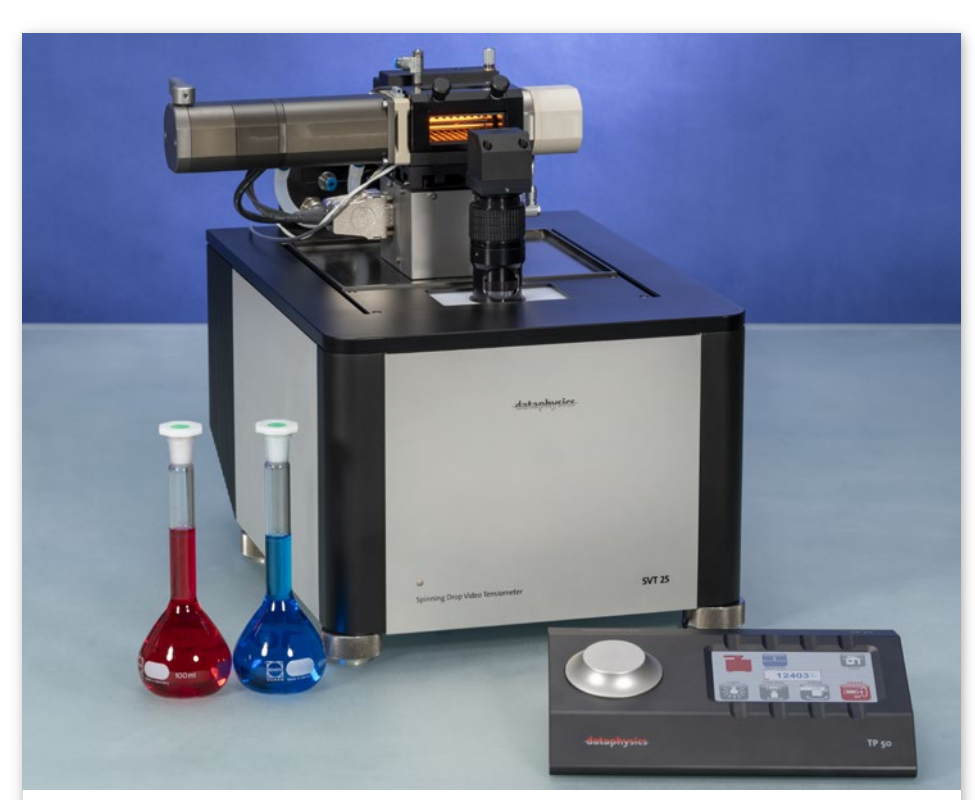
SVT 25 with temperature controlled measuring cell MC-TPC 25 and TP 50 control panel

Due to the high-performance cam era with USB 3 interface the spinning drop can be analysed with exceptional