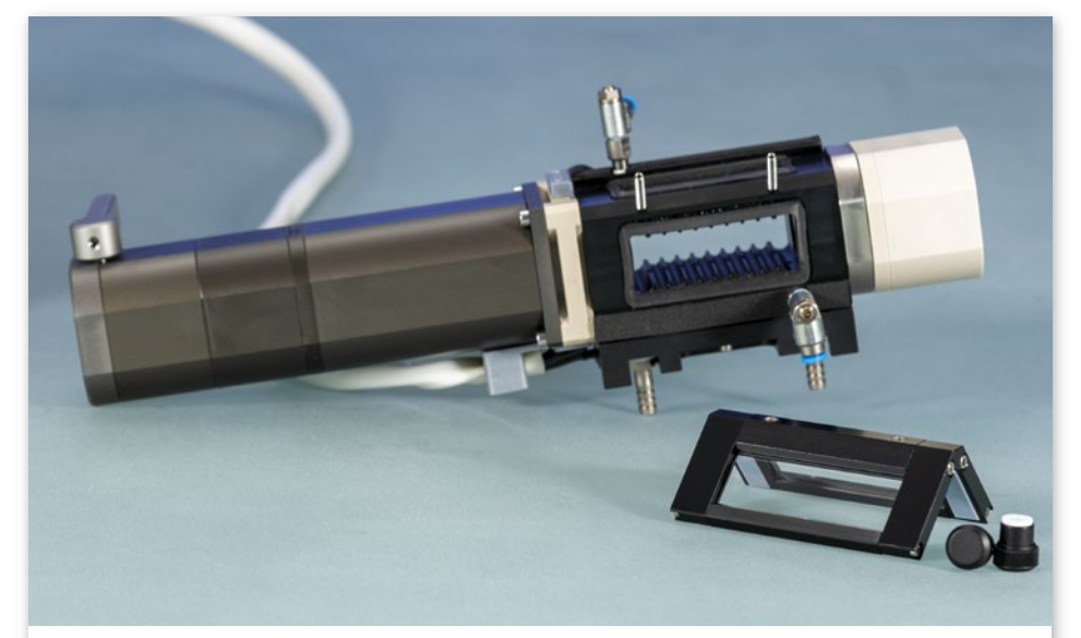
measuring cell with removable observation windows for easy cleaning

Due to a specially designed capillary and a resulting higher pressure tolerance the SVT 25 can even be used with wa ter-based solutions at up to 130 °C.