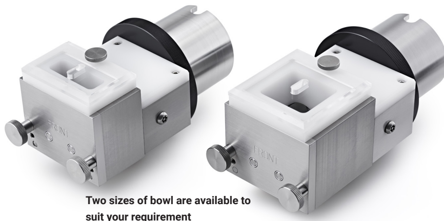
Two sizes of bowl are available to suit your requirement